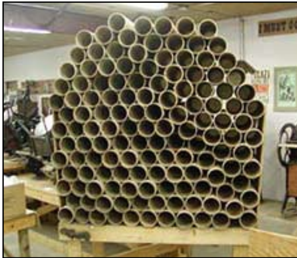
The tubes stand ready to receive the posters.

However, might the association consider doing this every two or three years assuming a coordinator can be found and some means to help defray the costs? Any volunteers?