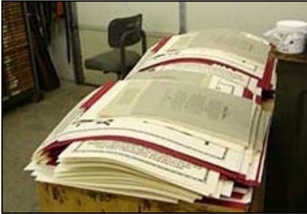
Collated posters now ready to be inserted into the tubes.

members are disorganized as hell. 3. APA members can't understand directions. 4. APA members can't count. 5. There's no way I would ever be mailer!"