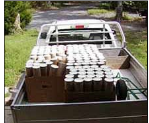
Ready for the ride to the Posts Office!