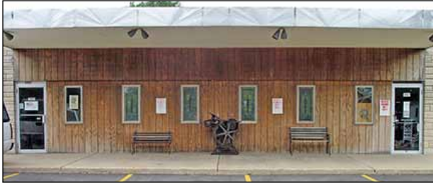
The Platen Press Museum—4000 sq. ft. of goodies!

with a dream of someday having his own museum. By 1992 he had run out of room in his garage and found a 4000 sq. ft. building in December 1993 located in Zion, Illinois. In June 1994 he was offered early retirement from his industrial arts teaching career. Everything seemed to fall into place at that time to make his dream come true.