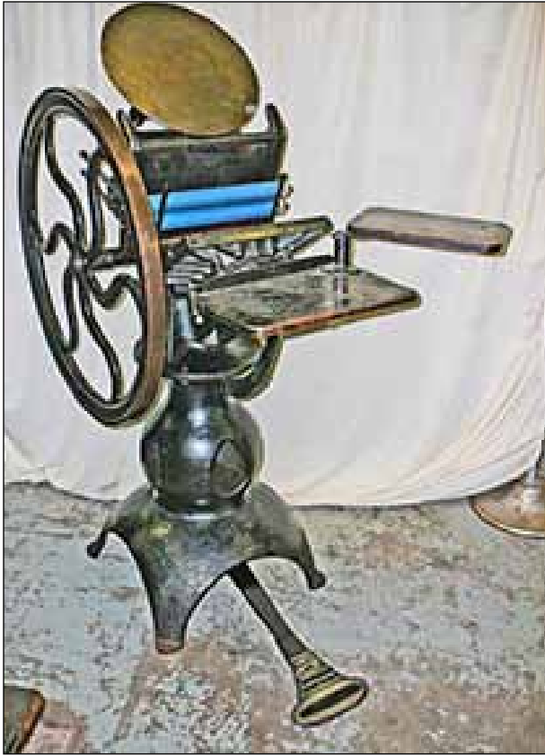
Top: The Golding Official 8x12 Rotary. Left: Some of the 6000 books at the museum relating to printing.

During his college years he worked part-time as a Linotype operator at a weekly newspaper and in the composing room at the college. He bought his first press (an 8x12 C&P) in 1970.