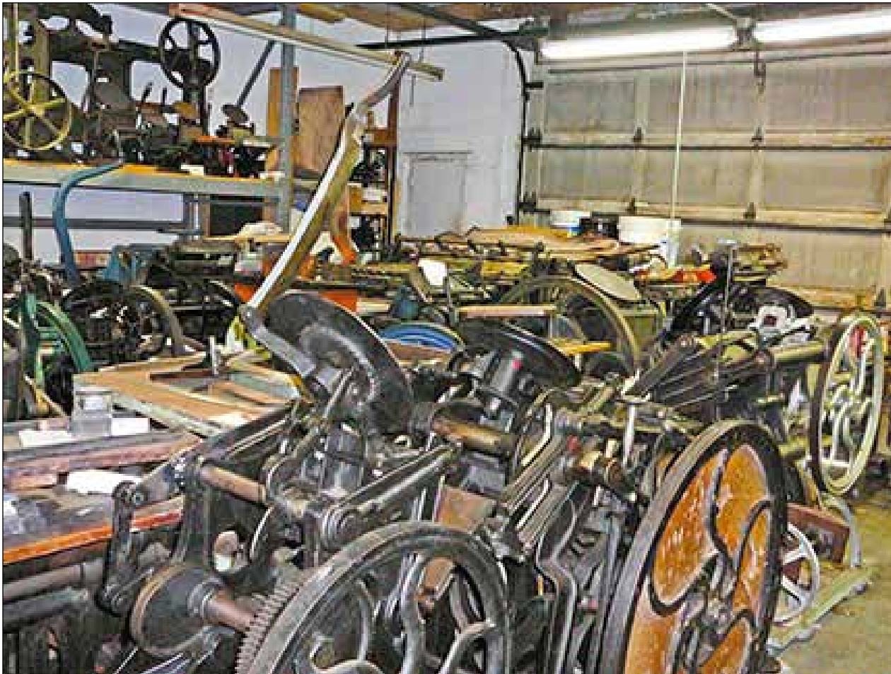
A few of 50-some different platen presses on display at the museum.

only other minor downside Paul confessed to is that before people come to visit he has to clean the bathrooms and of course after they leave, has to wash up the presses.