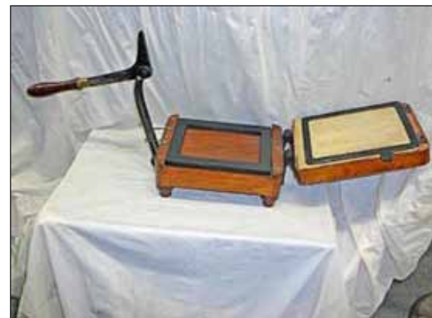
The Cowpers Parlous Press.