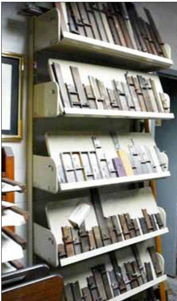
Part of the display of 275 different composing sticks.