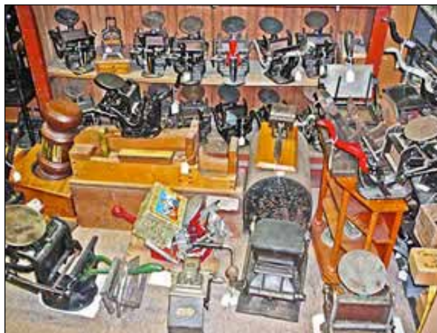
Shown here are just a part of the 300 table top presses that are housed at the Platen Press Museum in Zion, Illinois.