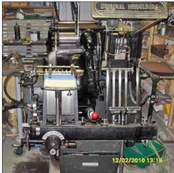
Heidelberg 10x15 platen.

Sometime in the 1980s I found a nice Vandercook No. 4 for fifty bucks. After a new set of form rollers, it proved out to be one fine press. Then about 2002 I found a Vandercook Universal 1 with all-electric drive and adjustable bed. It was sitting in the back of a large printing company, covered over with cartons of old magazines and junk. About the same time I found a Heidelberg 10 x 15 platen. Although it was