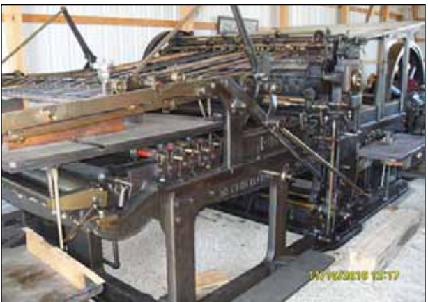
Miehle, maximum sheet, 38x55.

Coming this next year to Printers' Hall is a No. 00 Miehle two-revolution press. It weighs about twelve tons; this 1906 example is in amazing condition. Also coming is a Kelly B 17x22 press that is in fine condition. These activities help to keep me busy in retirement. We also have located an ancient folder that was operated with a flat belt from a lineshaft, but we're not sure yet if it will be restorable. Now that it is freezing cold in Iowa, it'll be the perfect time to do some bundle pieces and a Treasure Gems page.