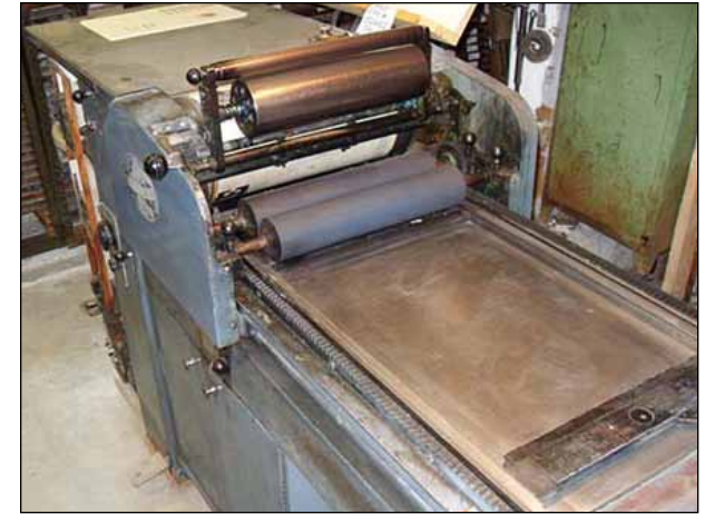
Vandercook's Universal 1.

a bit intimidating at first, I soon became enamored of it. As a result, I no longer have anything but this one and the Vandercook.