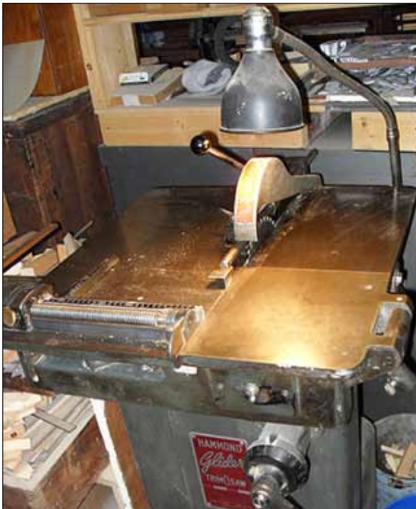
Hammond Glider saw.

Eventually I also wised up and found a nice Hammond Glider saw. I can't imagine why any printer would be without one! I simply use \frac{3}{4} inch pine and cut furniture and blockouts to fit the job. Sometimes